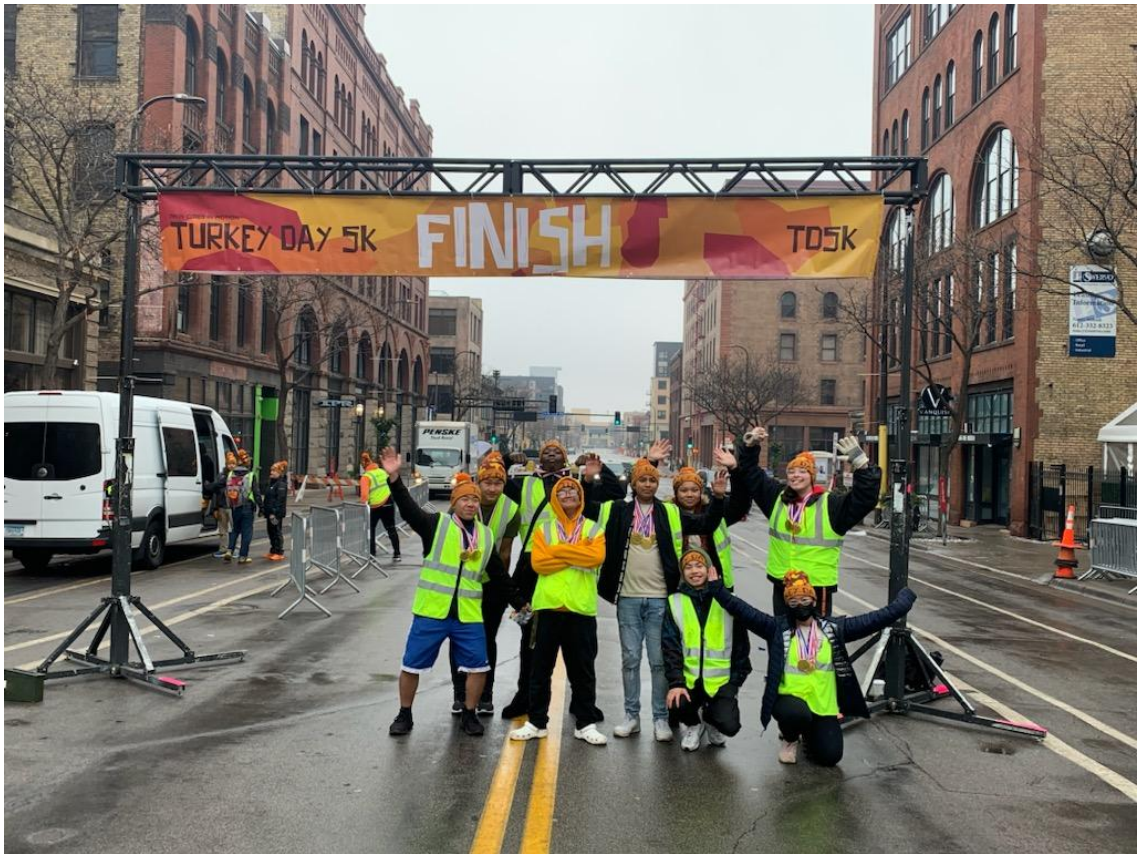
Superb dedication from Como Park cadets today at the annual Twin Cities Turkey Trot Community Service. Errrrr-Minneapolis, Minnesota. Happy Turkey Day!