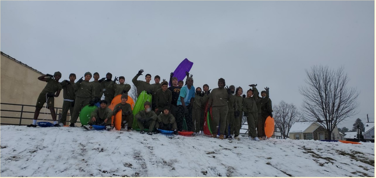
MCJROTC cadets take advantage of our first snow fall and thrust themselves into combat sledding. OOH RAH!